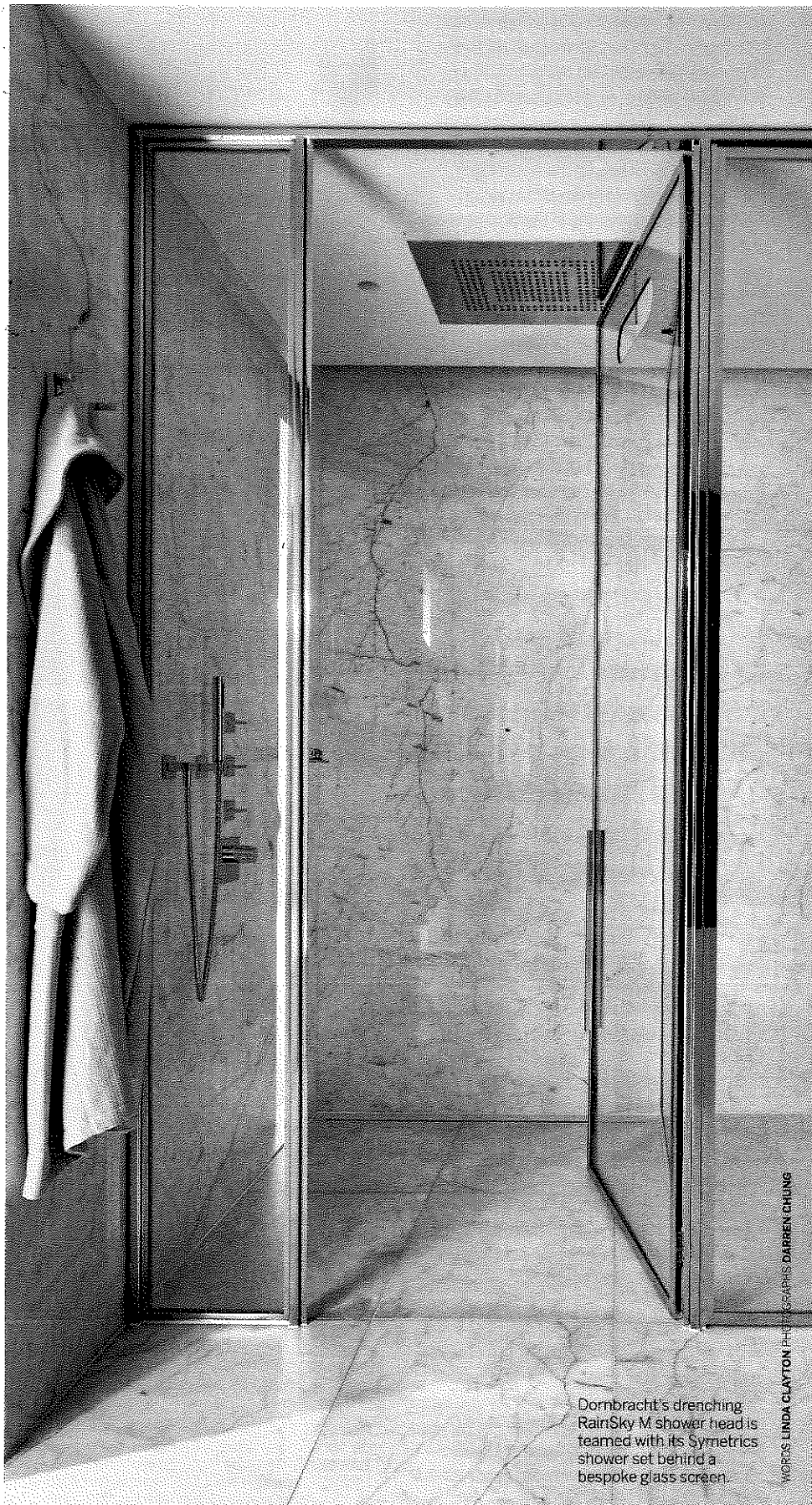
Dornbracht's drenching RainSky M shower head is teamed with its Symetrics shower set behind a bespoke glass screen.

at Walton Bathrooms, 01992 224784, waltonbathrooms. co.uk. Starck 3 undermounted basins, £165.60 each; Bette Art steel inset bath, from £6,740.40, all CP Hart, 0845 873 1100, cphart.co.uk. RainSky M shower head, from £6,500, Dornbracht, 024 7671 7129, dornbracht.com. DuraStyle wall- mounted bidet, £182; wall-mounted toilet, £195, both Duravit, 0845 500 7787, duravit.co.uk.